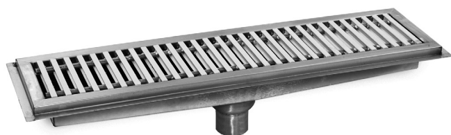
model #FT-1248-FG floor trough with fiberglass grating

Eagle Floor Trough with fiberglass grating, model _____. Unit constructed of 14/304 stainless steel all-welded construction. Drain pan has built-in pitch towards drain, accommodates up to a 4"-diameter pipe, and comes standard with a stainless steel removable perforated basket. Fiberglass grating to be 1" high yellow polyester material with a non-slip grit top surface. Tapered "I" beam construction for ease of cleaning and drainage. Gray color grating available.