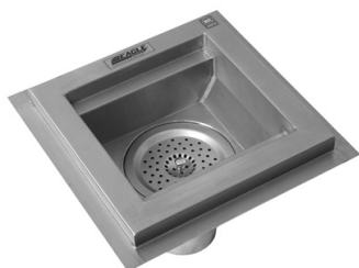
model #FD-FG floor drain (with grating removed)