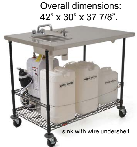
sink with wire undershelf

Overall dimensions: 42" x 30" x 37 7/8".