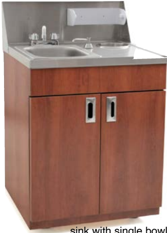
sink with single bowl

Features plywood cabinet base with "Biltmore Cherry" Wilsonart® laminated millwork, locking doors with satin finish handles, and 3" recessed plate casters with rubber tread.