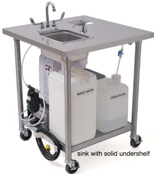
sink with solid undershelf