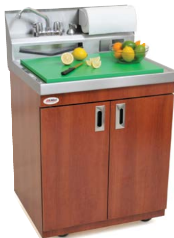
sink with water plate removed and poly board added, ready for cutting or prep work!