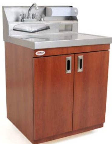
sink with removable water plate

Remove the plate by simply lifting the front of the plate and unhooking the rear flange.