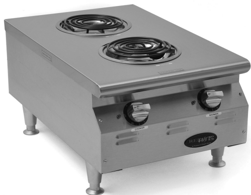
electric hot plate

Eagle Chef's Line® Electric Hot Plate, model _____. Heavy gauge stainless steel top and front with aluminized steel sides. Infinite controls with On-Off light for adjustable heat setting, swing-up elements with individual crumb trays for cleaning.