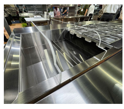
WATCH OUR VIDEO TO LEARN MORE!