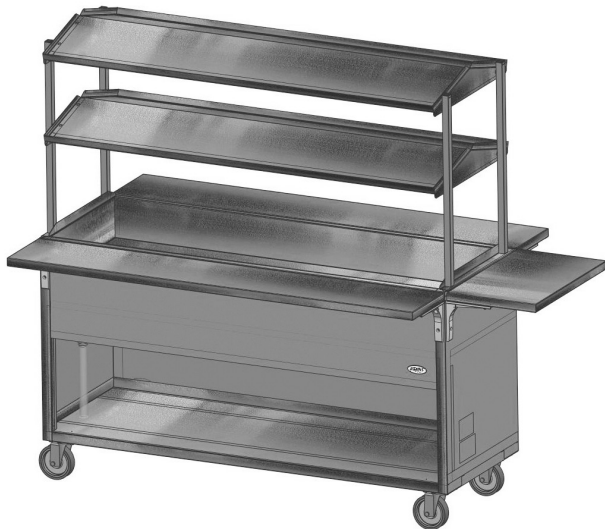
#INS-4OB-M-1D (shown with optional #TS-DB-HT4 tray slides)

Eagle Spec-Master® Grab-N-Go Double-Side Shelf Unit, model _____ . Stainless steel open base cabinet with 6"-deep insulated pan, 5" plate casters (two with brake), 1" drain with valve. Available with double-sided shelves with single- or double-tier. Includes POS end shelf and push handle. Optional tray slides available.