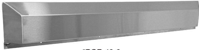
#BGR-48-6 bumper guard rail