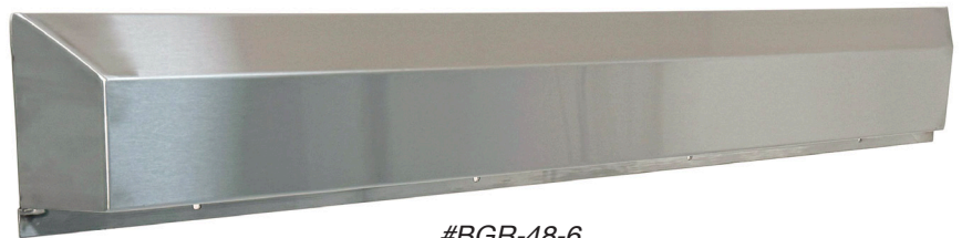
#BGR-48-6 bumper guard rail

Designed to protect walls against everyday dings, scratches etc. in high-traffic areas, Eagle Group's NEW Wall Mounted Bumper Guard Rails are fixed in place, using wall-mounted hidden "z-clip" brackets that are screwed into place first and easy to install. The hidden brackets, along with the underside of the Guard Rails, ensure a solid, sturdy installation. Plus, the polished stainless steel finish adds beauty to any facility. Bumper Guard Rails are 2" front-to-back and available in heights of 4", 6" and 8", and in lengths ranging from 36" to 96".