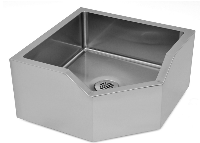
corner mop sink #F2121-8-CDE