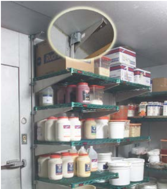
use in refrigerators/freezers

EAGLE'S CANTILEVERED SHELVING SYSTEM IS A SYSTEM THAT SEEMS TO DEFY GRAVITY... NO POSTS ON THE FLOOR; NO NEED TO REINFORCE SIDE WALLS. INSTEAD, A COMBINATION OF UPRIGHTS AND BRACKETS SUPPORT UP TO 530 LBS. PER SHELF.