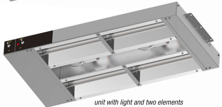
unit with light and two elements

Keep your foods hot and fresh with Eagle's NEW RedHots® Stainless Heat Lamps. The housing consists of the beauty and durability of stainless steel. Simple toggle switch operation. These undermount units do not need brackets. Single and double heat lamps available. Offered in standard- or high-watt, and with or without Teflon-coated shatter-proof halogen light bulbs.