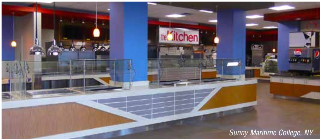
Sunny Maritime College, NY