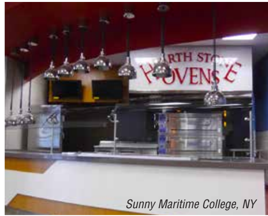
Sunny Maritime College, NY