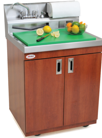
sink with water plate removed and poly board added, ready for cutting or prep work!