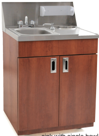
sink with single bowl

Features plywood cabinet base with “Biltmore Cherry” Wilsonart® laminated millwork, locking doors with satin finish handles, and 3”recessed plate casters with rubber tread.