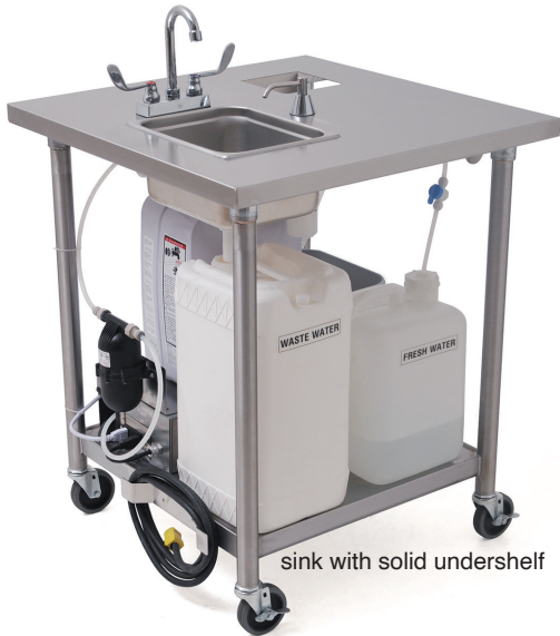
sink with solid undershelf

Features heavy gauge stainless steel tabletop with 10 3/8" x 12 3/4" x 6" removable pan, deckmount faucet, and trash chute. Overall dimensions: 30" width, 30" length and 34 7/8" height.