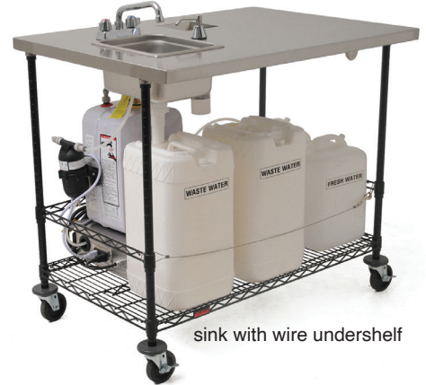
sink with wire undershelf

Overall dimensions: 42" x 30" x 37 7/8".