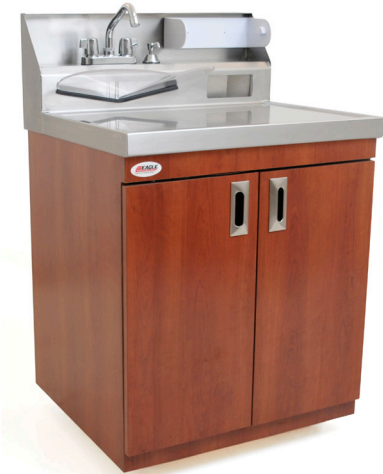
sink with removable water plate

Used with optional poly board, sink with removable acrylic water plate can be turned into a portable cutting area or prep station! Remove the plate by simply lifting the front of the plate and unhooking the rear flange.