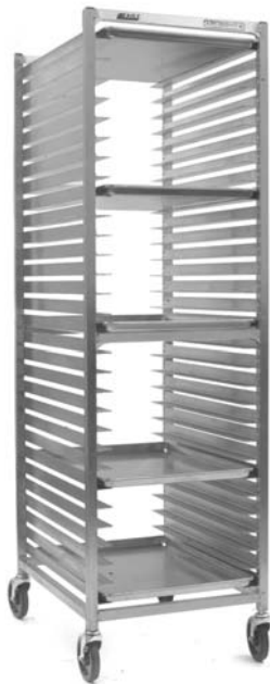
all-welded pan rack #OUR-1830-2/W

Eagle Panco® All-Welded Pan Rack, model _____. Front-loading and side-loading models available. Constructed of 1" square tubular aluminum frame and supports. 1½" x 1½" extruded aluminum tray slides with two raised beads to minimize friction. Slides are welded to vertical posts. Slide spacing to be 5", 3", or 2" to accommodate (10, 12, 20, or 30) full size sheet pans. Furnished with 5"-diameter casters. Shipped assembled. #OUR-1810-3/W rack is 38" tall and features stainless steel top. All others are full height and feature open top.