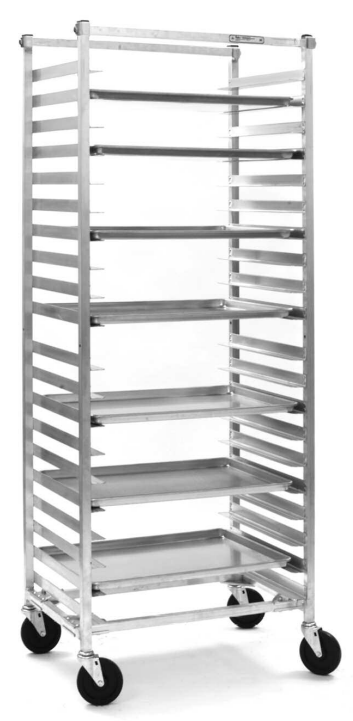
26 Series rack

Eagle Panco 26 Series Pan Rack, stainless steel model ______. Stainless steel construction with 1" square tubular frame and cross supports. 1%6" x 1%6" x 1%6" stainless steel tray slide with a raised bead edge riveted to stainless steel vertical tube. Slide spacing to be 5", 3", or 2" to accommodate 11, 18, 20, or 30 full size sheet pans. Furnished with 5"-diameter casters. Unit shipped assembled.