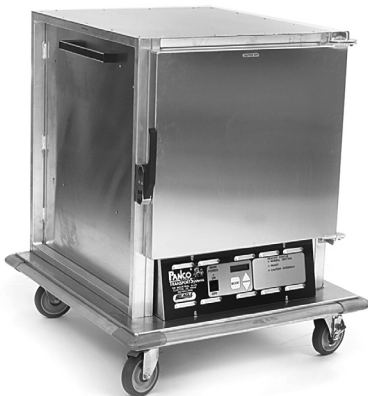
half size heated cabinet with solid door

Eagle Half Size Heated Holding Cabinet, model _____ . Aluminum interior and exterior, patented TEMP-GARD® air flow design, (insulated/non-insulated), bottom mount control panel, door (solid, or with polycarbonate window), and adjustable digital temperature control system with LCD readout. Removable (wire/universal wire) slides on 2¼" standard spacing, full perimeter bumper, 8' cord & plug, and 5"-diameter heavy duty polymer swivel casters, two with brakes.