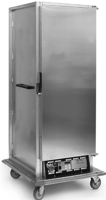
full size non-insulated heated cabinet with solid door