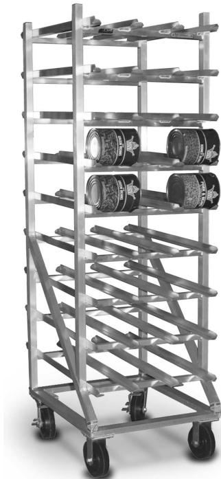
model #OCR-10-9A mobile can rack

Eagle Panco® Full Size Mobile Can Rack, model OCR-10-9A. All-welded aluminum construction, crossbraced front-to-back and side-to-side. Aluminum angle rack slides secured to frame at a slight angle to allow for gravity feed. Furnished with 6"-diameter casters. Capacity: 162 #10 cans or 216 #5 cans.