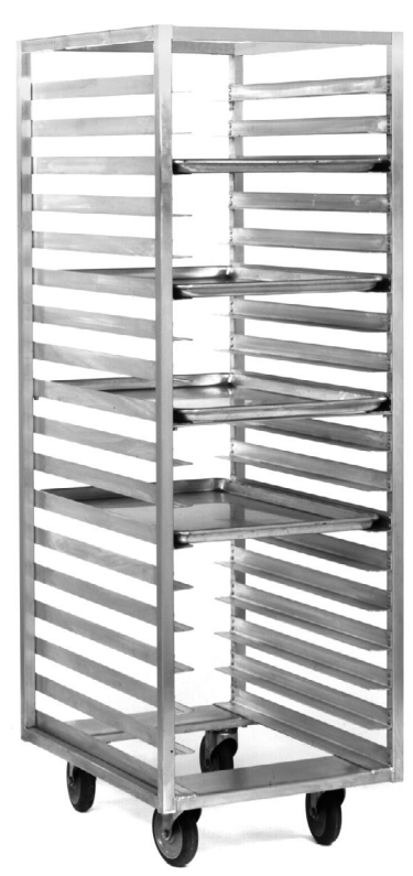
roll-in refrigerator rack

Eagle Panco® Roll-In Refrigerator Rack, aluminum model ______. Frame, corner uprights, top and bottom constructed of 1" square aluminum tubing. 11% x 11% extruded aluminum tray slides with raised beads to minimize friction. Slide spacing to be 21%, 3", or 5" to accommodate (24, 18, 11, or 36) trays. Furnished with 5"-diameter casters. Shipped assembled. Note: Model #UARR-64-A comes with 12 universal angle slides, accommodating a variety of pan/rack sizes.