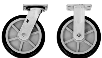
#3000261 swivel caster