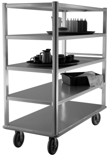
aluminum banquet cart

Eagle Banquet Cart, model _____. Available in aluminum (with all-welded aluminum construction), or stainless steel (with all-welded aluminum frame with stainless steel shelves). Handles and uprights with smooth radius. Features include two handles (one per end of unit), solid shelves with marine edge, perimeter bumper, and heavy duty 8" x 2" platform casters (two swivel, two rigid).