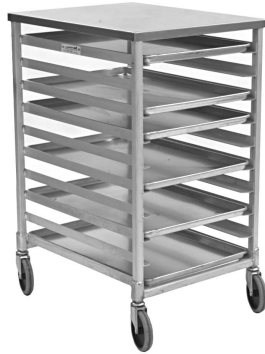
all-welded pan rack #OUR-1810-3/W