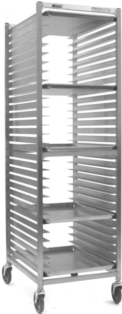
all-welded pan rack #OUR-1830-2/W

Eagle Panco® All-Welded Pan Rack, model _____. Front-loading and side-loading models available. Constructed of 1" square tubular aluminum frame and supports. 1½" x 1½" extruded aluminum tray slides with two raised beads to minimize friction. Slides are welded to vertical posts. Slide spacing to be 5", 3", or 2" to accommodate (10, 12, 20, or 30) full size sheet pans. Furnished with 5"-diameter casters. Shipped assembled. #OUR-1810-3/W rack is 38" tall and features stainless steel top. All others are full height and feature open top.