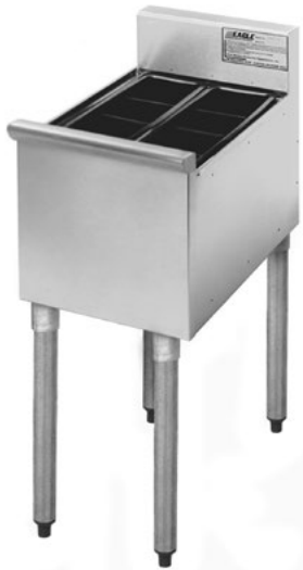
#MA5-18 bottle storage unit

Eagle (1800 / 2200 Series) Modular Add-On Storage Base Units, model _____. Stainless steel bottom shelf and interior sides. Unit slides underneath the under bar equipment. 1½" O.D. galvanized tubular legs with adjustable bullet feet.