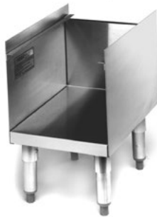
#MAB12 storage base unit