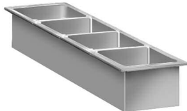
bottle holder tray