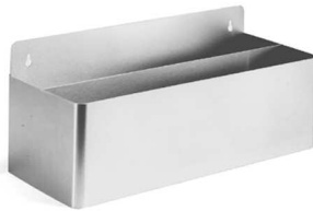
double-tier speed rail