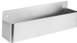
single-tier speed rail