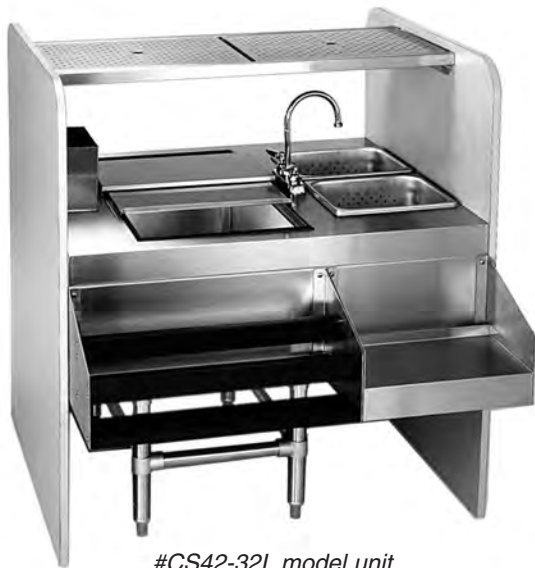
#CS42-32L model unit

Eagle Spec-Bar® Cocktail Station, model _____. Heavy gauge type 304 stainless steel body, legs, leg channels and cross rails with plastic laminate-covered wooden end panels (color to be determined). Two stainless steel deep-drawn sinks with stainless steel perforated lift out baskets, T&S gooseneck faucet, stainless steel blender shelf, stainless steel double speed rail with ABS for sound deadening, foamed-in-place stainless steel ice chest with sealed-in 8-circuit post mix cold plate, 4" x 8" x 6½"-high tubing chase. Stainless steel overshelf with removable stainless steel perforated inserts.