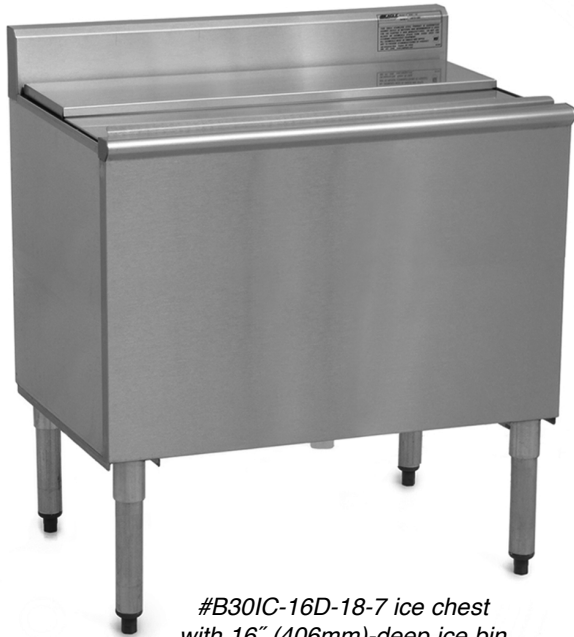
#B30IC-16D-18-7 ice chest with 16" (406mm)-deep ice bin

Eagle 1800 Series Ice Chests with Sealed-In Cold Plate, model _____ . Top, front, backsplash and ice bin to be heavy gauge type 304 stainless steel. Fabricated ice bin is fully insulated with 1½" drain, and sealed-in 7-circuit cold plate. 1½" O.D. galvanized tubular legs with adjustable bullet feet.