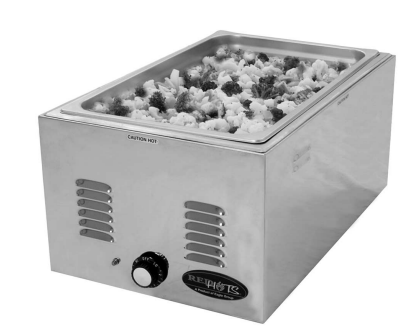
#1220FWD-120 food warmer with 12" x 20" well, shown with optional food pan

Eagle RedHots® Countertop Food Warmer, model ______. Highly polished exterior body, with deep drawn 304 stainless steel heat well. Infinite control with "On" indicator light, wet or dry operation.