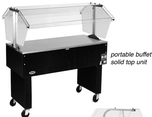
portable buffet solid top unit

Eagle Portable Buffet Cashier's Stand, model CS-1. Polished stainless steel top with black plated steel body, enclosed on three sides with storage area under drawer, and stainless steel bottom panel. Stainless steel front mounted cashier drawer. 4" swivel casters, two with brakes.