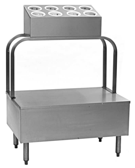
tray stand with optional silverware unit