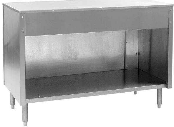
unit shown with open front