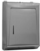
model #318496 towel dispenser

Hand Sink Accessories & Options—Miscellaneous