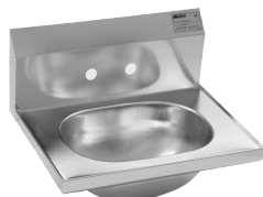
hand sink with electropolished finish

Item No.: _____ Project No.: _____ S.I.S. No.: _____