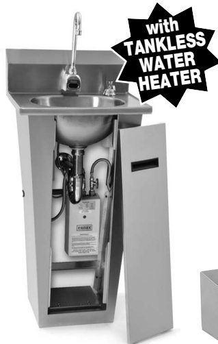
hand sink with hot water heater