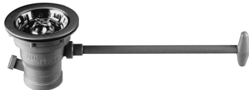
polymer rotary drain