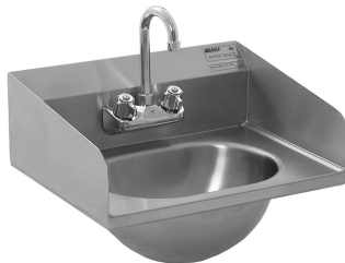
hand sink with optional end splashes