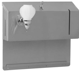
model #DP-10 towel dispenser