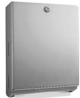
model #318496 towel dispenser