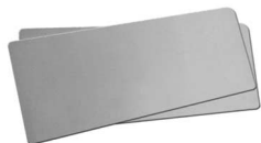
pair of end splashes for field installation