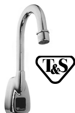
T&S electronic-eye faucet