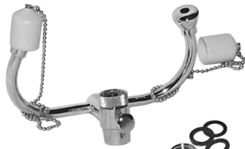
emergency eye wash unit #326272