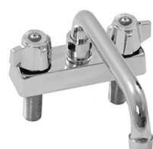
deck mounted faucet with 8" spout