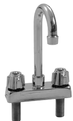
deck mounted faucet