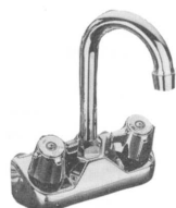
splash mounted faucet