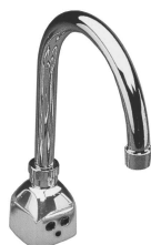
battery-powered electronic-eye faucet