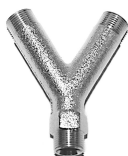
non-temperature adjustment valve