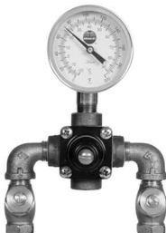
anti-scald valve #373848