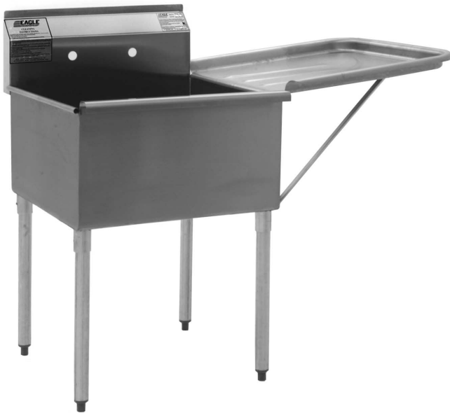
detachable drainboard shown attached to utility sink*

Eagle Detachable Drainboard for Utility Sink, model _____ . Constructed of type 304 or 430 stainless steel with die-stamped rolled rim construction. Left or right hand operation. Furnished with easy clip on installation.