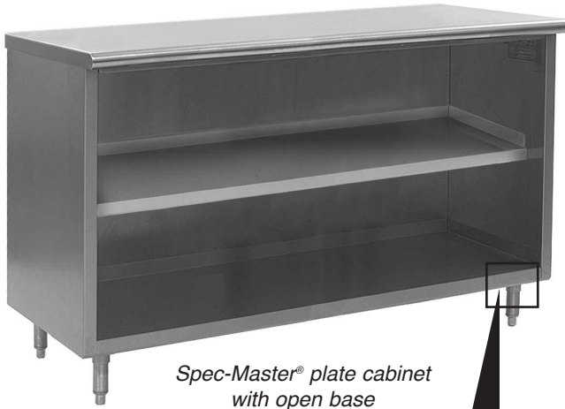
Spec-Master® plate cabinet with open base

Eagle Spec-Master® Plate Cabinet, model _____. Top is 14 gauge type 304 stainless steel—with ends and rear turned down 90° and rolled rim on front—reinforced with full-length stainless steel hat channel. Full-length fixed center shelf and body are heavy gauge type 430 stainless steel. 1½" O.D. type 304 stainless steel tubular legs with 1" adjustable bullet feet. Available with open front, sliding doors, or hinged doors.