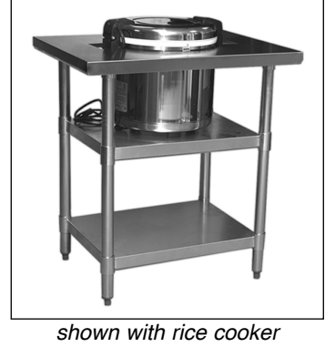
(not sold by Eagle)