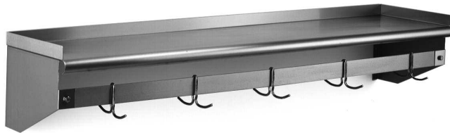
wall shelf with rack

Eagle Wall Shelf with Removable Hooks, model _____. Shelf is constructed of 16 gauge type 430 stainless steel, with 1½" roll on front and 1½" upturn on rear and ends. 2" x ¾" type 304 stainless steel flat bar. Furnished with double-prong stainless steel removable hooks, one every 12".