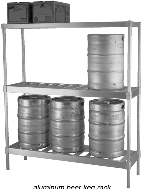
aluminum beer keg rack

Eagle Aluminum Beer Keg Rack, model _____. Heavy duty extruded aluminum construction with two heavy duty shelves for kegs, and a third shelf for general storage. Shelves are adjustable in 2" increments. Posts are 1 1/16"-diameter, marked in 2" increments with end caps on each end. Shipped knocked down.