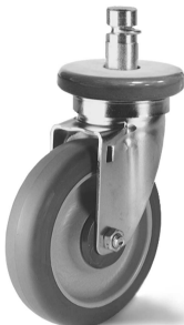
(nickel-plated) caster with polyurethane tread