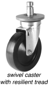
swivel caster with resilient tread

* See charts for complete model numbers.