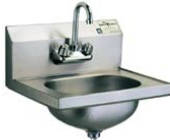
HSA-10-F* The industry standard