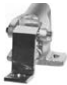
single foot pedal Model #355994