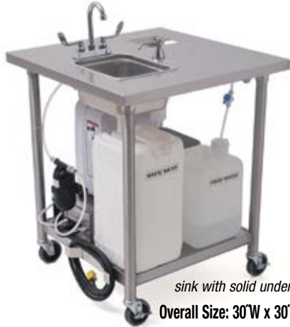
sink with solid undershelf

Features heavy gauge stainless steel tabletop with 10 \frac{3}{8} " x 12 \frac{3}{4} " x 6" removable pan, deckmount faucet, and trash chute.