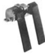
double knee pedal Model #313481