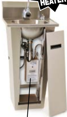
hot water heater

Applicable models include: HSA-10, HSA-10-F, HSA-10-FA, HSA-10-FDP, HSA-10-FE, HSA-10-FDPE, HSA-10-FDPEE, HSA-10-FW, HSA-10-FA-P and HSAD-10-F