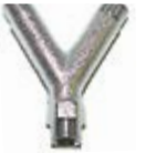
Y-inlet mixing valve