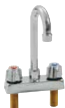
deck mount faucet model #302004