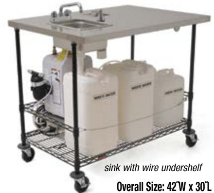
sink with wire undershelf

Overall Size: 42"W x 30"L x 37 \frac{1}{8} "H