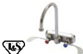
T&S faucet model #313305