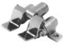
double foot pedal Model #300604