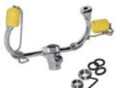
emergency eye wash unit model #326272