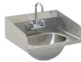
hand sink with optional end splashes

For Field-installation: Model #HSA-SSK Self-adhesive splash can be used for right or left application.