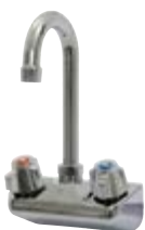
splash mount faucet model #303987

All faucets below feature 4" (102mm) centers, except where noted.