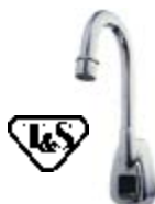
splash-mount T&S electronic-eye faucet model #356128