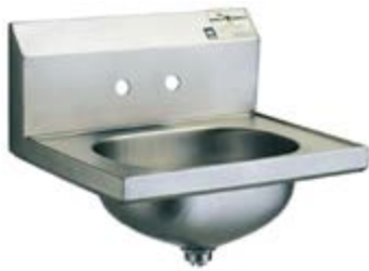
HSA-10* Basic hand sink

These units are wall mounted and come with basket drain or lever drain, and “Z” wall mount bracket. Basket drain and lever drain come with crumb cup. Most of these units have accessories as standard components.