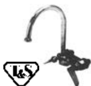
T&S faucet model #306134