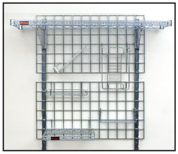
Wall mat with wire shelf and multiple accessories