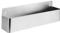
single-tier speed rail