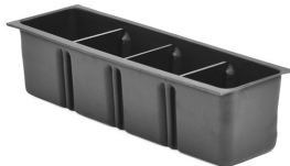
bottle holder tray