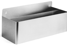
double-tier speed rail