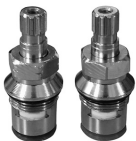
#368421 faucet repair kit