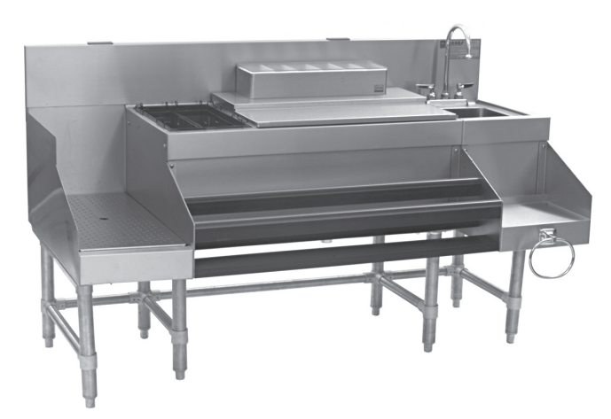
combination cocktail station

Eagle Spec-Bar® Combination Cocktail Station; model ______. Heavy gauge type 304 stainless steel body, legs, leg channels and cross rails. Models offered with (12" or 18") recessed workboard with 11/2" drain and stainless steel removable perforated insert, or with (12" or 18") tiered liquor display with ABS for sound deadening—#CCS-72 has both. (36" or 42") combination foamed-in-place insulated ice chest with bottle holders. Two 1%" x 21%" tubing access holes in top of backsplash. Condiment dispenser. 12" single wet waste sink with T&S faucet and perforated lift-out strainer. Stainless steel blender shelf with towel ring and rear cord access hole. Stainless steel double speed rail with ABS for sound deadening, and stainless steel adjustable bullet feet.