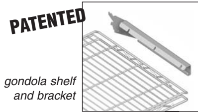
gondola shelf and bracket

Eagle Stand-Outs™ Patented Gondola Wire Shelving, model _____ . Designed for use on all major fixtures (Kent, Madix/Lozier, Royston, Streater, Universal Nolin, or PermaSteel)—specify when ordering. Comes standard in 36" and 48" lengths, with shelf brackets that are notched to securely hold the display shelf in place. Can be positioned horizontally or slanted. Wall standards available if not mounting to gondolas.