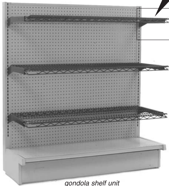
gondola shelf unit