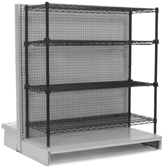
gondola with Gondola Inset Add-A-Shelf®

Eagle Freestanding Gondola Inset Adjustable Reverse Mat Add-A-Shelf® Wire Shelving, model _____. (EAGLEBrite® Zinc, Chrome, Black, Red, White) reverse mat Add-A-Shelf® with a built in ledge. 300-lb. weight capacity.