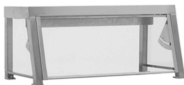
tilt/adjustable sneeze guard