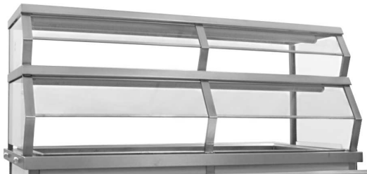
double tier sneeze guard