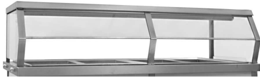
single tier sneeze guard

* See charts for complete model numbers.