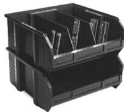
bins with dividers