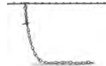
model # DC16-S

16" (406mm) long. Used for conductive applications.