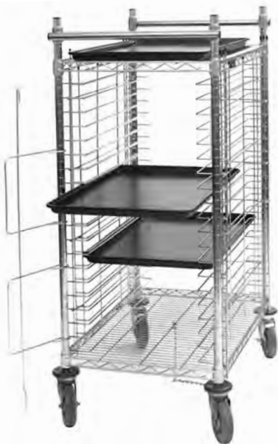
ETCE20-Z half size, end load model with optional drag chain and ESD trays

Overall cart dimension 31¼" width x 21½" length for end-load models. Overall cart dimension of 21½" width x 31¼" length for side-load models. Full height model, in front- or end-load models, allows for 30 trays. Half height model, in front- or end-load models, allows for 20 trays. 5"-diameter 50 shore A polyurethane wheels. Optional conductive split sleeves and grounding cables provide ESD characteristic. Front and back tray locks.