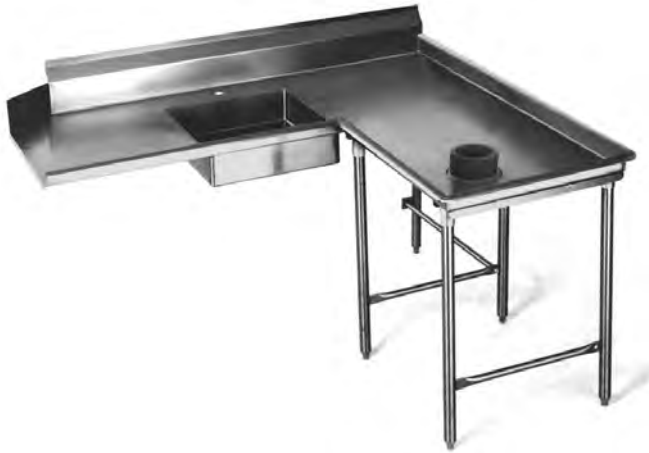
right-hand model shown

Eagle Soiled Dishtables, model _____. Top to be 16/430, 16/304, or 14/304 stainless steel with all seams welded, ground smooth, and polished. Front and ends to have 3"-high upturn with a 1½"-diameter rolled edge. Galvanized hat channels welded to underside. Backsplash is 8"-high. 20½" opening for dishwasher. 20" x 20" x 5" deep stainless steel prerinse sink with basket drain. Hole for deck mounted prerinse spray. Rubber scrap block provided. Legs to be 1½" O.D. galvanized tubing with 1" diameter crossbracing and adjustable bullet feet (14/304 models come standard with stainless steel hat channels welded to underside of table, stainless steel crossbraced legs, and adjustable metal feet).