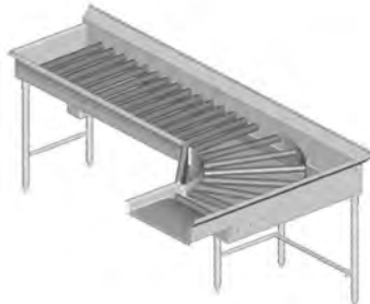
corner dishtable with optional PVC rollers