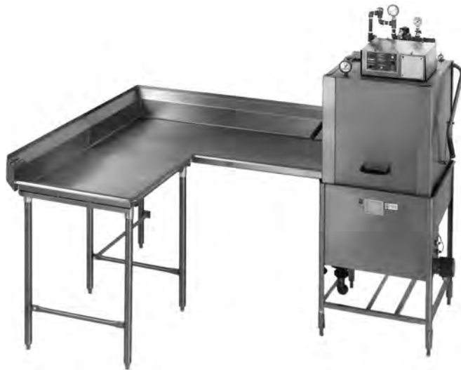
left-hand model shown (dishwasher not included)

Eagle Clean Dishtables, model _____. Top to be 16/430, 16/304, or 14/304 stainless steel, with all seams welded, ground smooth, and polished. Front and ends to have 3"-high upturn with 1½"-diameter rolled edge. Galvanized hat channels welded to underside. Backsplash is 8"-high, 20½" standard opening for dishwasher. Legs to be 1½" O.D. galvanized tubing, 1" diameter crossbracing and adjustable bullet feet (14/304 models come standard with stainless steel hat channels welded to underside of table, stainless steel crossbraced legs, and adjustable metal feet).