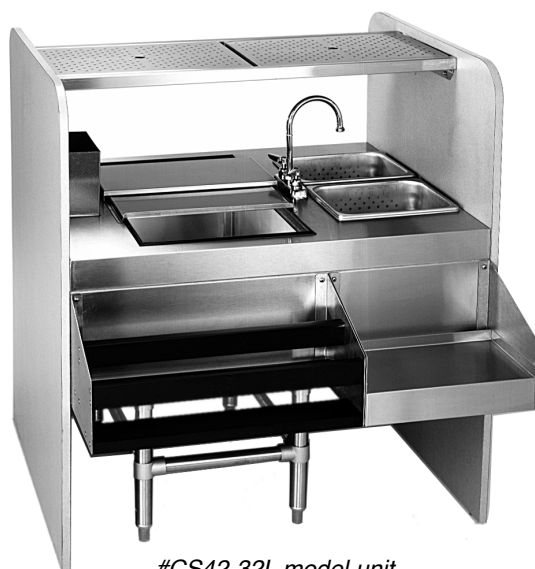
#CS42-32L model unit

Eagle Spec-Bar® Cocktail Station, model _____. Heavy gauge type 304 stainless steel body, legs, leg channels and cross rails with plastic laminate-covered wooden end panels (color to be determined). Two stainless steel deep-drawn sinks with stainless steel perforated lift out baskets, T&S gooseneck faucet, stainless steel blender shelf, stainless steel double speed rail with ABS for sound deadening, foamed-in-place stainless steel ice chest with sealed-in 8-circuit post mix cold plate, 4" x 8" x 6½"-high tubing chase. Stainless steel overshef with removable stainless steel perforated inserts.